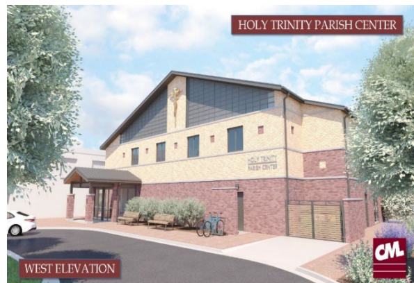
NEW PROPOSED HOLY TRINITY PARISH COMMUNITY CENTER

Or visit the parish website: https://www.holytrinitywestmont.org/